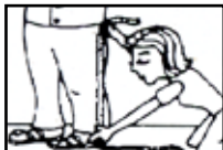
Have someone else measure you.