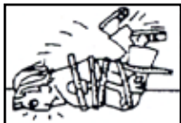
Don't measure yourself. Those measurements are never accurate.